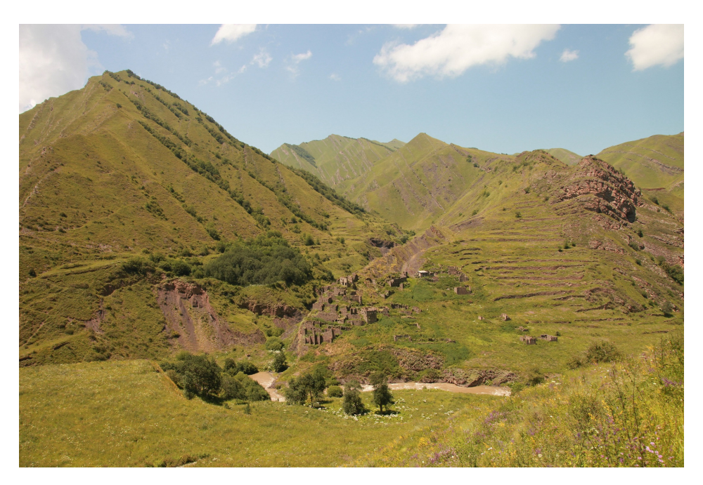
Figure 1.2: The village of Sanzhi in 2013