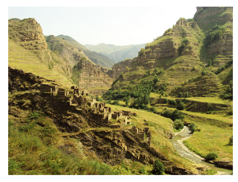
Figure 1.1: The village of Sanzhi in 2011 \,