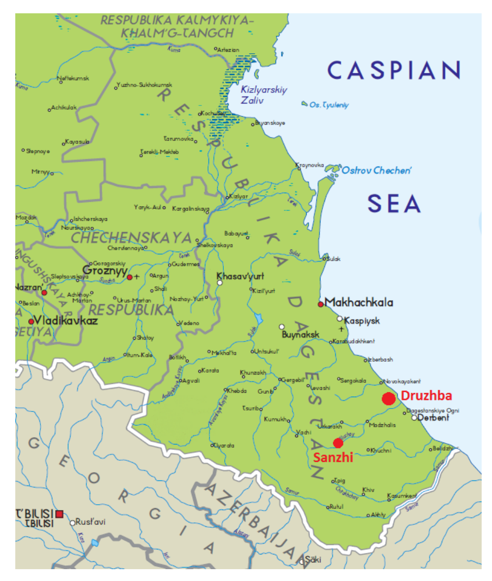
Figure 1.5: Map of Dagestan