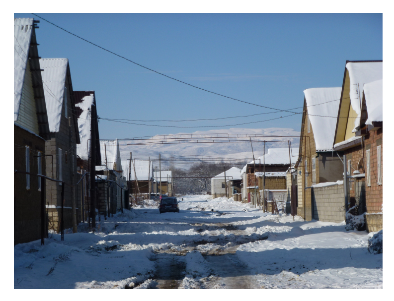
Figure 1.4: The village of Druzhba in the winter of 2014