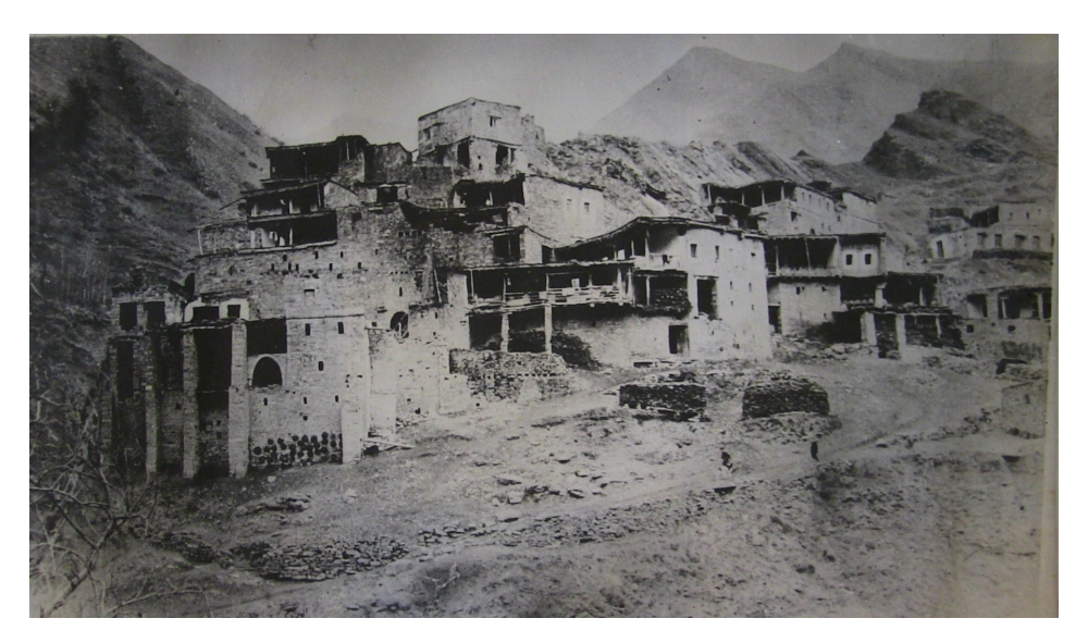
Figure 1.3: An old picture of Sanzhi, around 1957