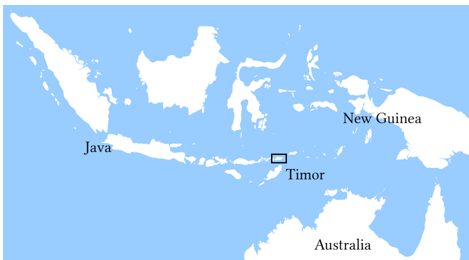
Figure 1: Alor and Pantar in Indonesia

show an interesting variety of alignment patterns, and the family has some cross-linguistically rare features.