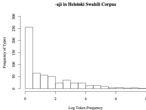
Figure 1: Histogram depicting the log of the Token Frequency along the x-axis, and the Frequency of Types occurring per log token frequency on the y-axis. This means that the bar furthest left depicts a group in which there are 250 tokens with a log frequency of zero (i.e. a frequency of 1, given that \text{Log}(1)=0 ).

Collapsing across the classes, we can assess productivity from the perspective of Token versus Type frequencies by identifying the average number of occurrences for each type. According to Bybee, a productive morpheme would have many tokens that occur only a few times, as opposed to a few forms that occur many times. Figure 1 represents the token frequency for each Type as a histogram.